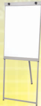
Tripod Flip Chart