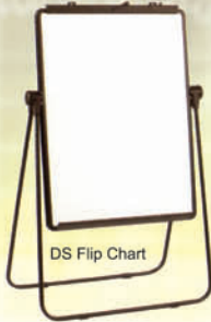
DS Flip Chart