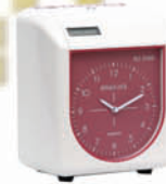
Analog Time Recorder