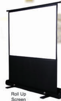
Roll Up Screen